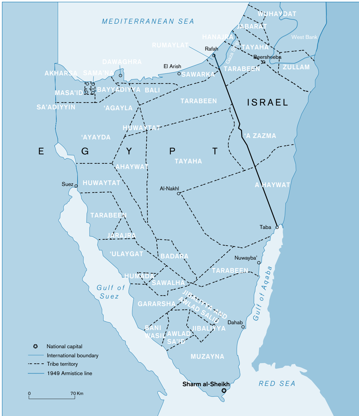
Map 2: The historical distribution of Bedouin tribes in Sinai

This map shows the approximate distribution of Bedouin tribes and is neither an exhaustive picture nor an attempt to represent legal control over territory.